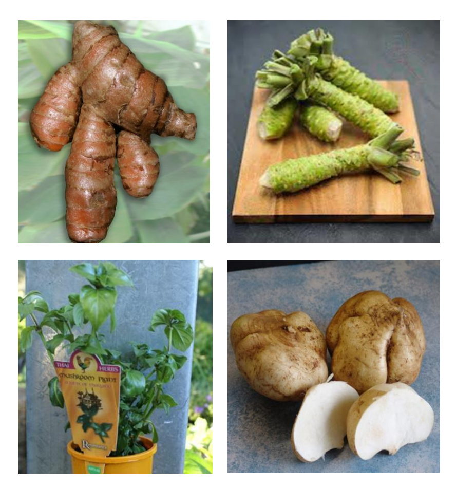
Figure 1. New is again the key but new is not new—it is just exotic. Top left to right: turmeric— Curcuma longa , wasabi— Eutrema japonicum ; Bottom left to right: mushroom plant— Rungi klossii , yam bean— Pachyrhizus erosus .

As an industry we are again at the mercy of what appear to be random shifts in demand. This causes excess and shortages in supply and rewards those willing to keep looking for what is new. The word "new" being very subjective as many "new" plants are very old to some cultures yet new to others (Figure 1). The winners in the new world of edible plants are those that have an understanding of edible plants as a source of food, as a part of an ornamental home garden and as status symbol in a shifting culture.